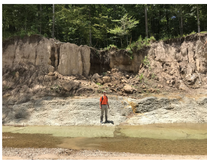
Jonathan Leard standing on the Yazoo Clay in front of an unconformable contact with a vertical Loess bluff in Section 12 Township 10N Range 3W.