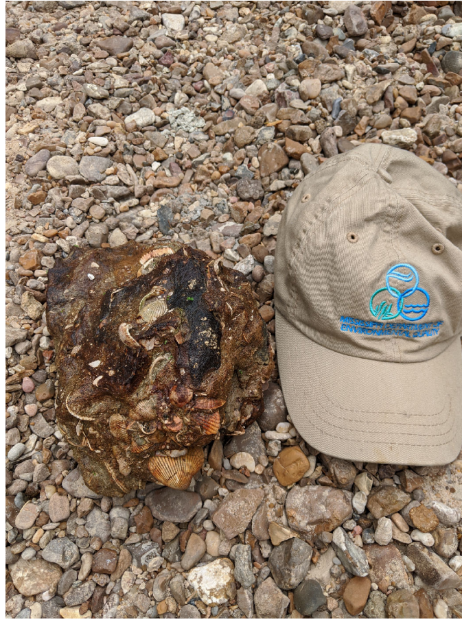
Moody's Branch matrix clast containing mollusk shells of the genus Glycymeris and Venericardia found as float in Perry Creek in Section 14 Township 10N Range 3W.