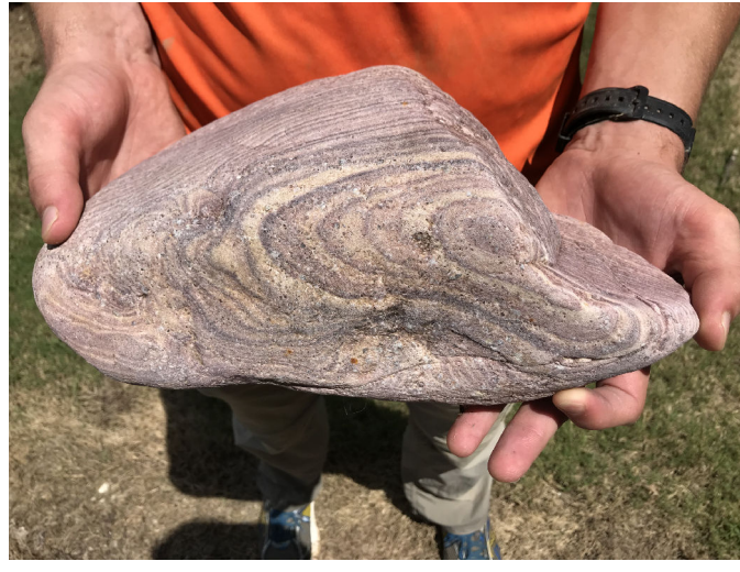
Sioux Quartzite cobble from Pre-loess Terrace Deposits in Section 14 Township 10N Range 3W.