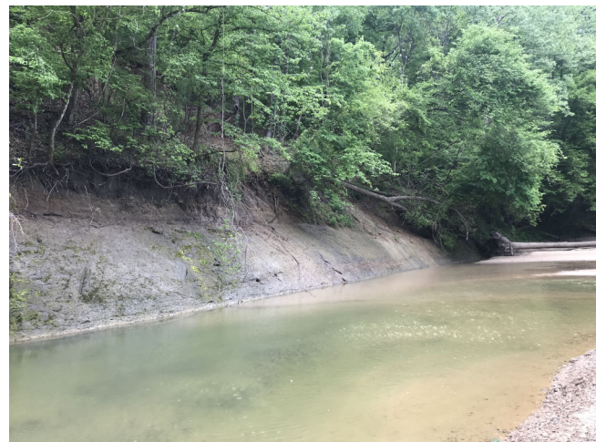
Exposure of the unconformable contact between the Moody's Branch and Cockfield formations, along Perry Creek in Section 13 Township 10N Range 3W.