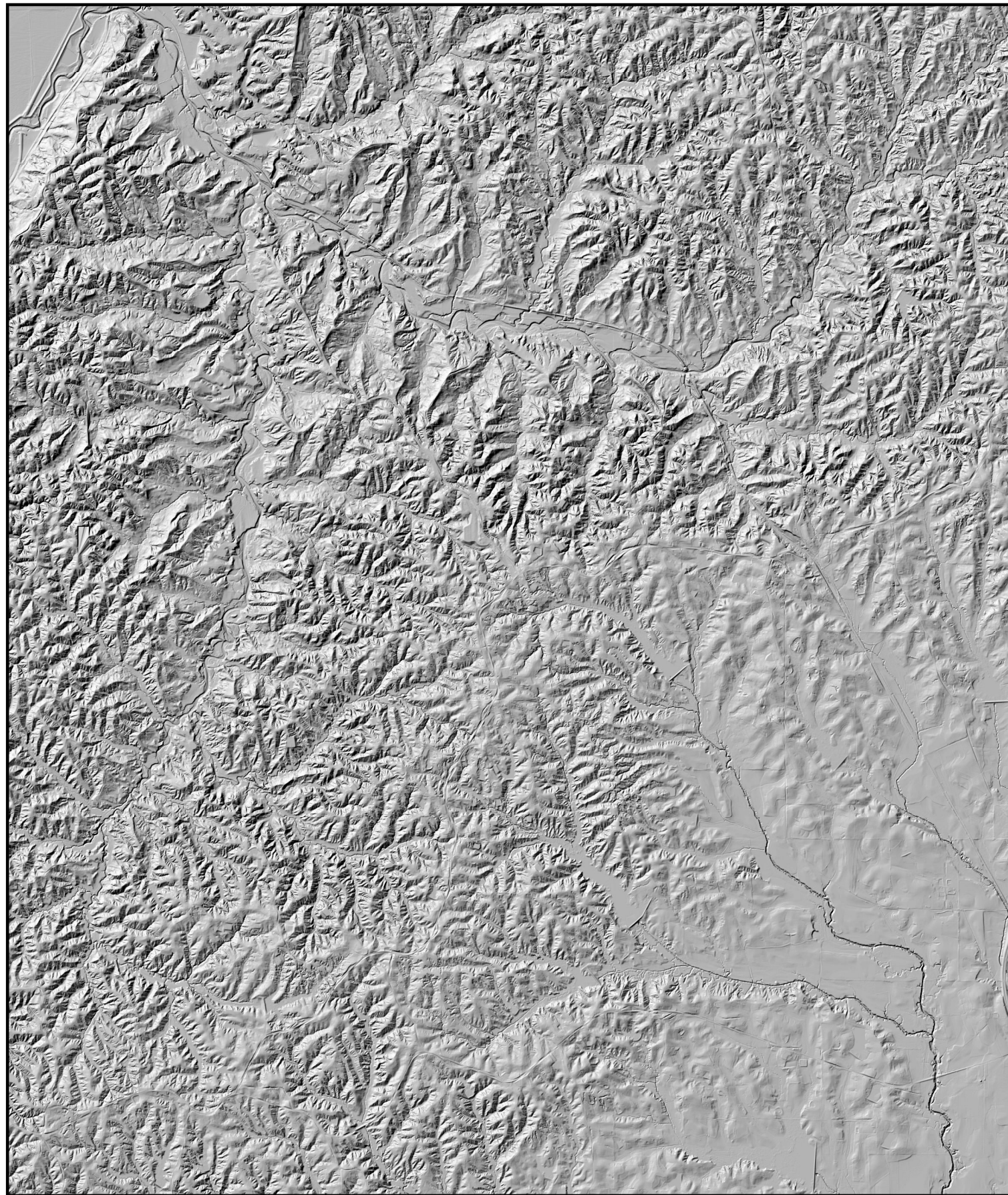
Bare Earth LIDAR Hillshade for the Tinsley 7.5 Minute Quadrangle. 1:70,000 1 inch = 5,833 feet 1 0.5 0 1 Miles