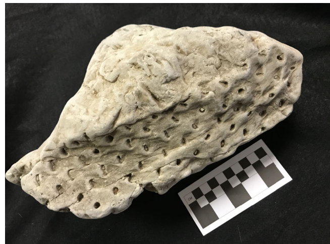
Ice-rafted specimen of the Carboniferous Age fossil Lepidodendron in sandstone from the Pre-loess Terrace Deposits, collected near Tinsley by Jeff McCraw.

Clay, brown, reddish-brown to grey in color; silty to fine-sandy; strongly carbonaceous to lignitic, slightly micaceous, pyritic. Carbonized and silicified plant fossils common. Underlies the Moody's Branch Formation unconformably. Outcrops along the active stream channel of Perry Creek just north of the border of the center of Section 13 and 14 Township 10 North 3 West near the apex of the influence of Tinsley Dome.