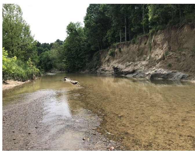
Alluvium derived from the Pre-loess Terrace Deposits and Loess filled valley in Section 14 Township 10N Range 3W.