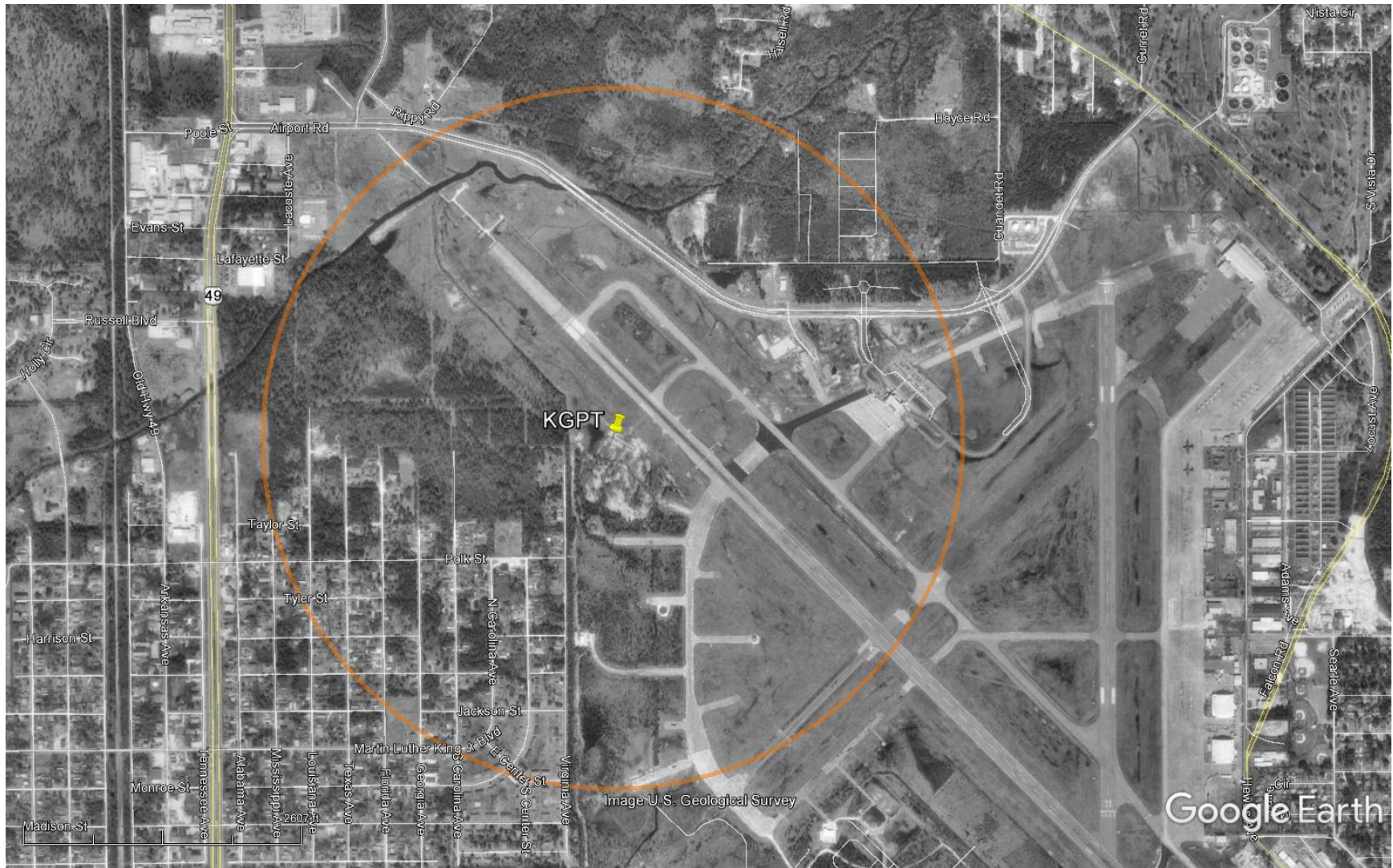
Figure 5 - Gulfport Station Aerial Photograph Feb. 18, 1992.