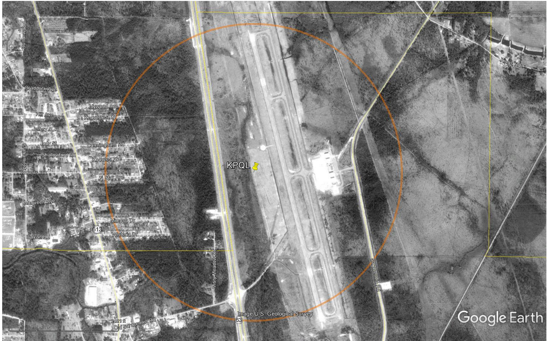
Figure 1 -Pascagoula Station Aerial Photograph Feb. 18, 1992.