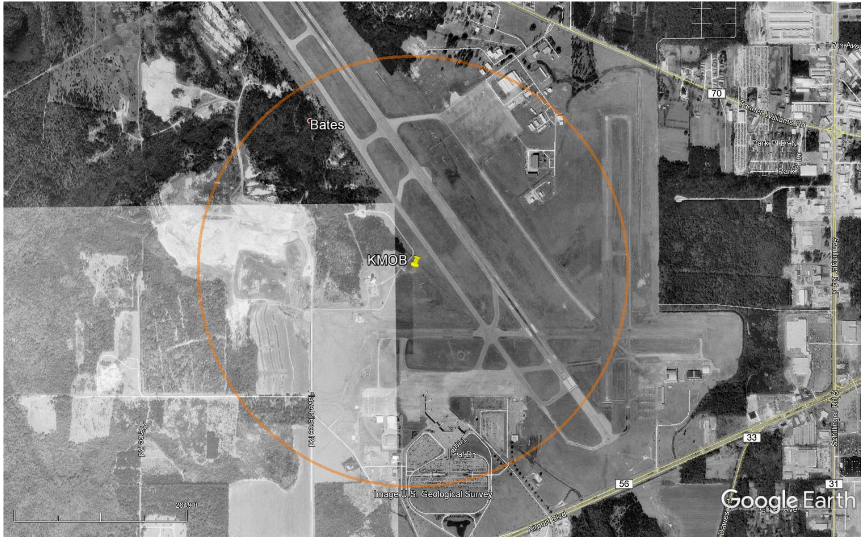
Figure 3 - Mobile Station Aerial Photograph Feb. 10, 1997.