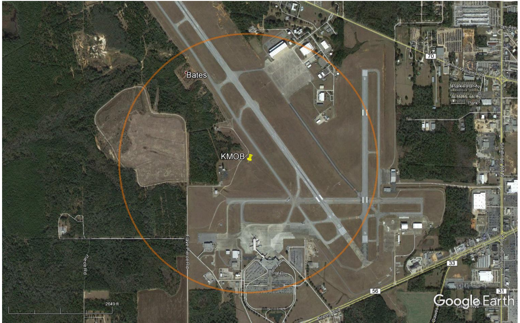
Figure 4 - Mobile Station Aerial Photograph Dec. 9, 2016.