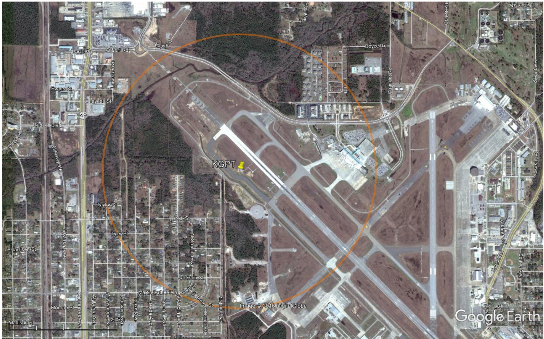
Figure 6 - Gulfport Station Aerial Photograph Feb. 24, 2016.