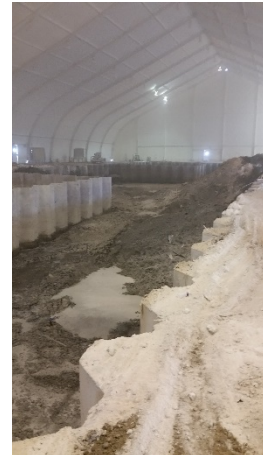
Cell #4 material