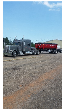
Shipping of rolloff boxes to Deer Park