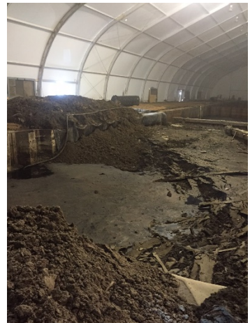
Cell #1 material stacked and draining