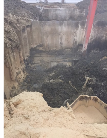
Base of Cell #2