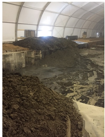
Stacked material dewatering to IB