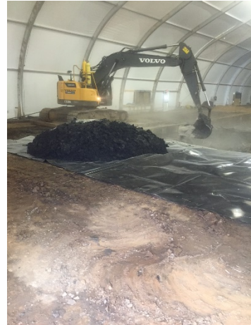
IB Cell #1 mixing and stacking