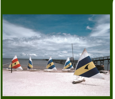
Mississippi Gulf Coast