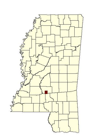
GEOLOGIC MAP SHIVERS QUADRANGLE Simpson, Jefferson Davis, and Lawrence Counties, Mississippi

N-8 Drill-hole locality and identification number