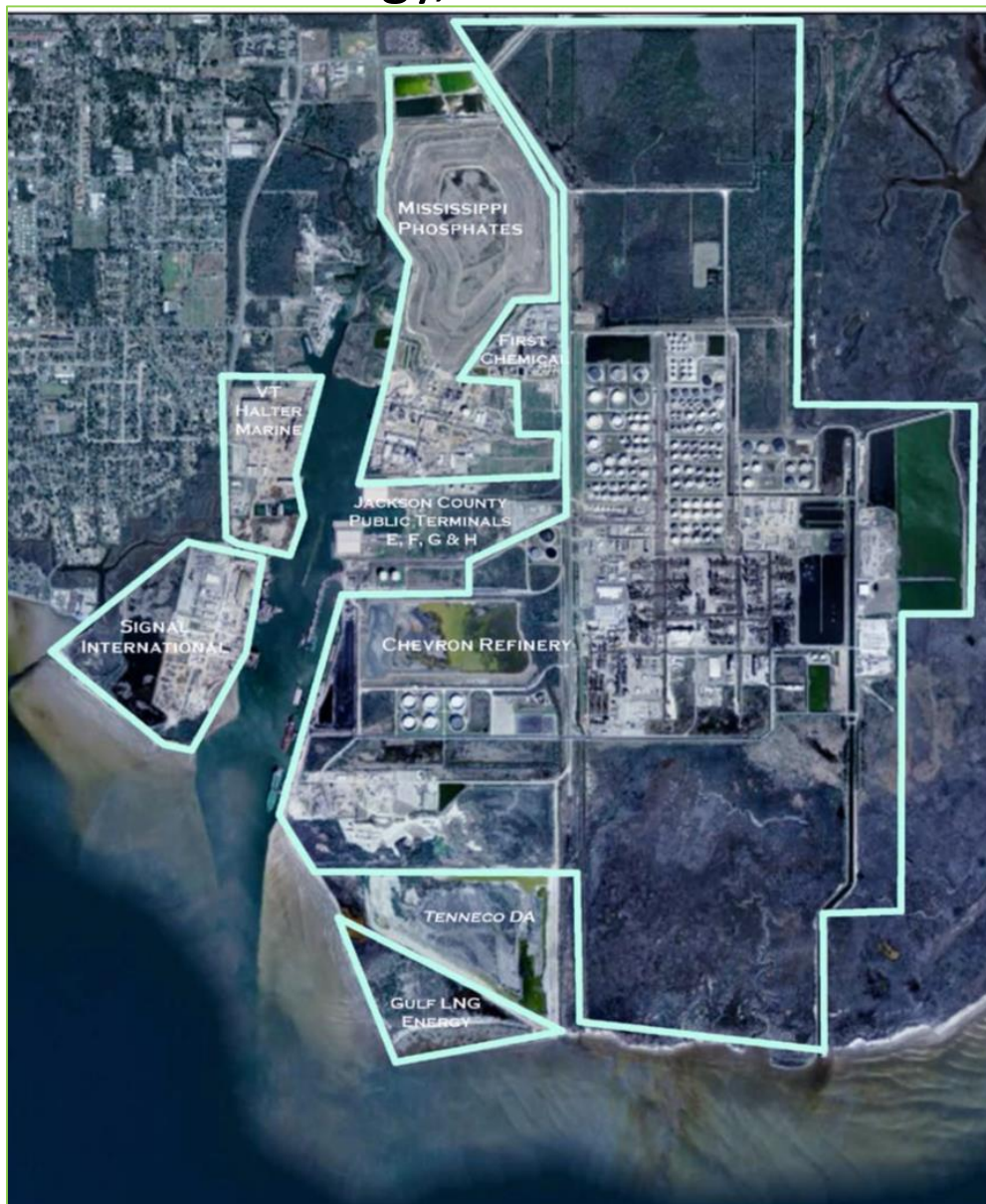
Map of Pascagoula Harbor with facilities indicated