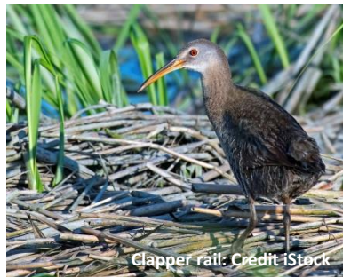
Clapper rail: Credit iStock

Posting, stewardship, and monitoring on beaches and barrier islands will benefit six focal species (American oystercatcher, black skimmer, least tern, Wilson’s plover, piping plover, and snowy plover). Assessments of abundance and distribution of focal marsh bird species (least bittern, clapper rail, marsh wren, Nelson’s sparrow, and seaside sparrow) will inform future habitat and marsh bird conservation efforts in the Gulf region. This effort will also support the conservation of significant wetland habitat, benefitting shorebirds and other migratory species through leveraged investment by the USDA Natural Resources Conservation Service’s Regional Conservation Partnership Program.