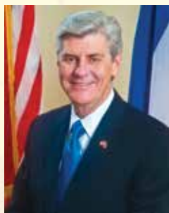
Governor Phil Bryant State of Mississippi

We encourage you to read this Report to learn more about the results from the GoCoast 2020 Commission, the ideas and priorities that came forward, and how this process has set a firm foundation to ensure that Mississippi is well-prepared for how the RESTORE Act can positively affect the Coast.