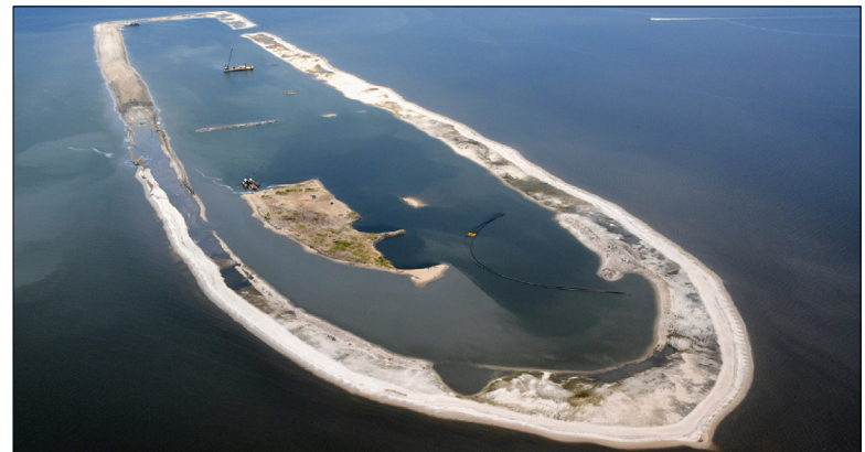
An aerial view of Round Island's sand berm during construction, June 2016.