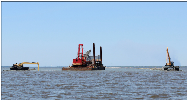
Construction of Round Island started in March of 2016.

This project is a collaborative effort between MDEQ, the Mississippi Department of Marine Resources, Jackson County Port Authority, and the U.S. Army Corps of Engineers.