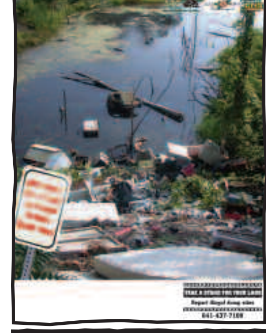
Newspaper insert for Appanoose County.

dumping program activities in all three communities also proved beneficial.