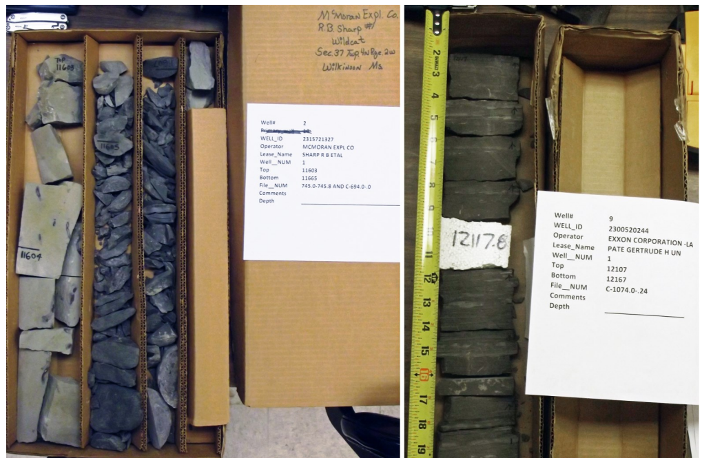
Figure 1. Cores from the Tuscaloosa marine shale sampled by the U.S. Geological Survey at MDEQ's Core and Sample Library in Jackson.