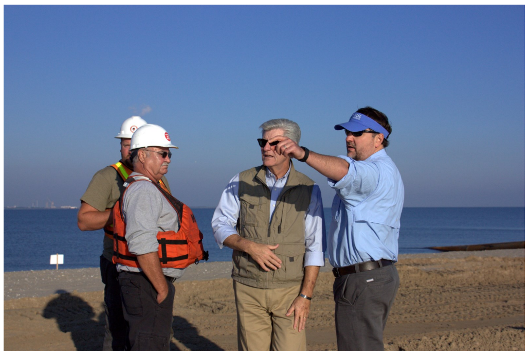
MDEQ's Gary Rikard with Gov. Bryant and construction staff at Round Island.

The $21 million project is funded from Round Two of the National Fish and Wildlife Foundation's (NFWF) Gulf Environmental Benefit Fund awarded to Mississippi and announced by Governor Bryant in November of 2014. Partners for Round Island include MDEQ, MDMR, the U.S. Army Corps of Engineers, and the Port of Pascagoula.