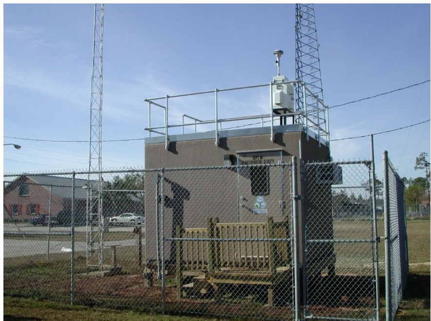
One of MDEQ's ten air monitoring sites.

MDEQ issues ozone and PM 2.5 forecasts for the Mississippi Gulf Coast, the Jackson Metropolitan area, and DeSoto County daily April 1 through October 31. This information is available to the public as well as being provided to weather media for inclusion in daily weather reports. For more information and to sign up for the daily forecasts, use the following link: http://bit.ly/2goqDCN .