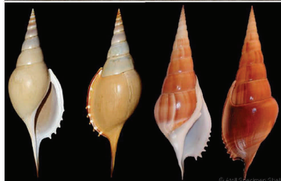
Figure 6. Top: Calyptrophorus stamineus (Conrad, 1856) from the Moodys Branch Formation (38 million years old) in pile borings at the construction site of the Museum of Mississippi History in Jackson, Mississippi. Web images: Bottom left: Living relative from the Japan and South China Sea, Tibia martinii Marrat, 1877. Bottom right: Living relative from the North Indian Ocean and Red Sea, Tibia insulaechorab Roding, 1798.